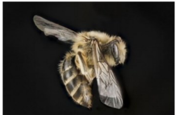
Colletes inaequalis , one of many types of ground nesting bee. You can see that they are very similar in appearance to honeybees.