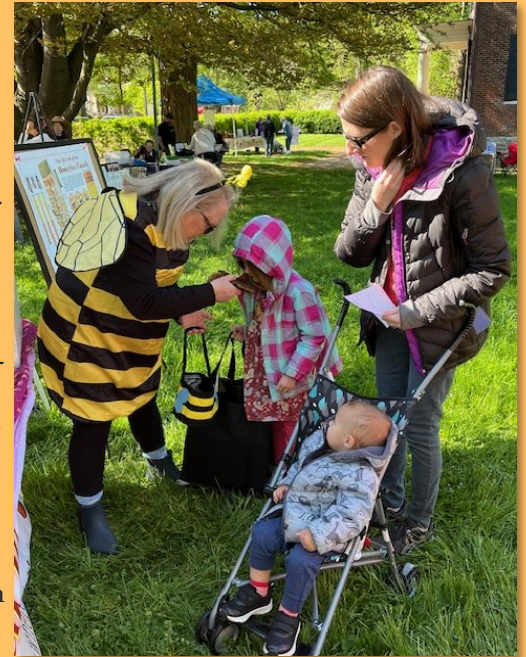
Children could see, feel, and smell real honey comb at the booth.

The Association also treated children with honey sticks and activity/ coloring books