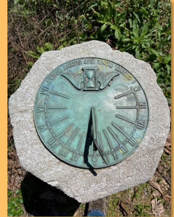
The garden kept good time, an hour to go.