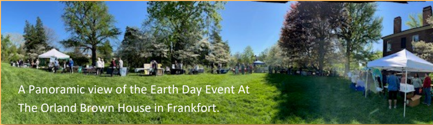
A Panoramic view of the Earth Day Event At The Orland Brown House in Frankfort.