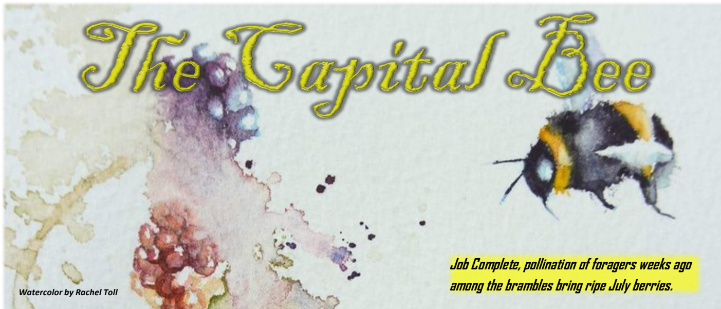
Watercolor by Rachel Toll

Job Complete, pollination of foragers weeks ago among the brambles bring ripe July berries.