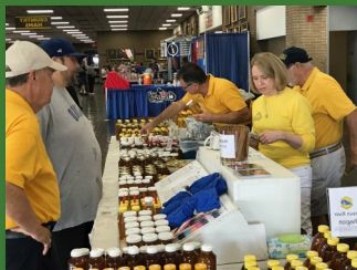
CCBA "worker bees" in action at the KSBA West wing Honey Booth with finding local (to buyers) honey, tastings, stocking, answering questions, and more.