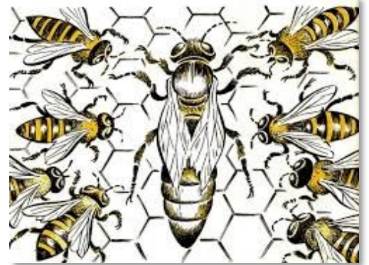
A committee of Kentucky beekeepers introduced Italian bees into Kentucky in 1872.

The quarterly continued that in 1880 I discovered, The Kentucky State Beekeepers Association “as we know it