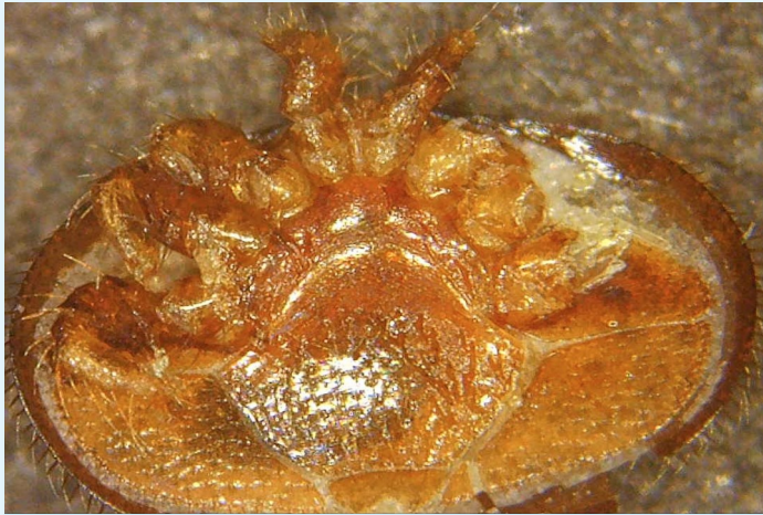
A microscopic view of a mite that has fallen victim to “chewing behavior”.

we catch these feral colonies to not only do so for the sake of increasing your holdings but also to check for evidence of “chewing behavior”. This is