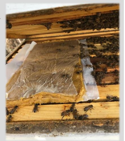
If the cluster is still "below" patties may be placed between boxes to keep feed near the bees.

We check every 10-14 days for bees having access to winter feed. We are now placing feed under lids and between the top 2 boxes of the configuration - unless we observe that the bees are still actively using one of the lower boxes.