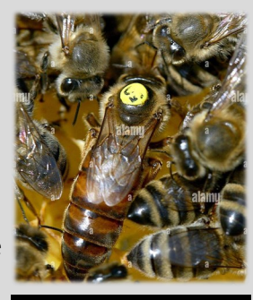
Mated queens ensure a quick start to early nucs. This year's color is yellow.

We also begin planning for a second round of splits in late April - early May when we are less reliant on 3rd party sources for queens, letting 50-75% of these latter splits to make their own queens. It's always a bet for or against mother nature - and if she'll cooperate weatherwise to let the mating flights not be disrupted by a late cold spell or precipitation. Some of our strongest hives can be split a second time - and other hives that began their build up later are also candidates for the April/May splits.