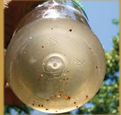
The "alcohol wash" method for checking varroa mite infestation is most accurate.

WHAT SHOULD WE BE DOING IN THE HIVES RIGHT NOW YOU ASK? WELL, HERE'S ANOTHER EXCERPT FROM "A CENTRAL KENTUCKY BEEKEEPERS CALENDAR" BY JOHN ANTENUCCI.