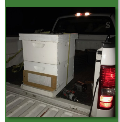
A hive recently moved at night from the backyard to the apiary in another county.

Sometimes you need to move a hive. Better pasturage, a yard becomes unavailable, another yard needs expanding, you've bought a complete colony -woodenware and all- or whatever the reasons maybe there will come an occasion to do so. Adhering to a few details will help make it successful. First, have the place where you are moving them to ready. Second, be aware of the temperature. You will need to confine them with an entrance cover with a screen like the robber screens you can find in supply catalogs to ensure good ventilation and don't forget to cover the ventilation holes if you have them. It may well go unsaid but to make sure you get all your bees remember to close shut up until night or before first light in the morning. After the foragers have returned. Secure the hive bodys with hive staples and/ or use a ratchet strap to hold the top cover; and get help, especially if its more than one hive body. Move them at night or at or before daylight in the morning, it all depends on how far you have to travel. Once set at the new location, turn them loose. These have worked for me and you'll soon see its not that difficult with a little planning. ~Wes