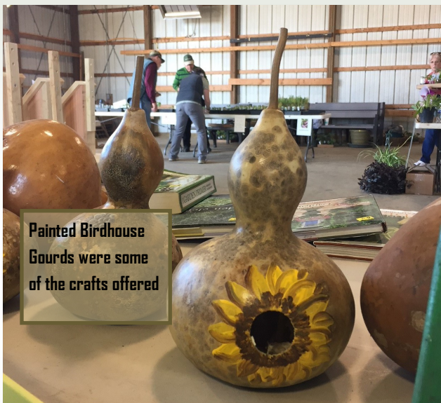
Painted Birdhouse Gourds were some of the crafts offered