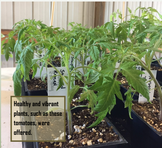
Healthy and vibrant plants, such as these tomatoes, were offered.