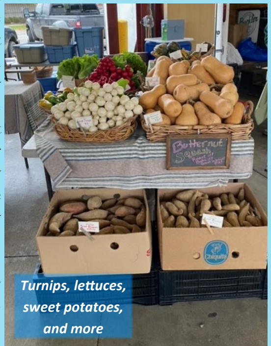
Turnips, lettuces, sweet potatoes, and more

to participate both Saturdays until April 16th. Afterwards the Market again is opened every weekend. If members still have honey to sell and want to brave the possible cold weather, they have the opportunity to do so and as Frankfort's Local Beekeepers, interact with the folks of the Capital City.