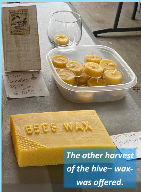
The other harvest of the hive—wax—was offered.

Besides extracted and cut comb-honey, beeswax and beeswax candles were also offered to the Market goers at the CCBA booth. The Market was well attended and seemed to decrease steadily after the temperature change. The winter Market is scheduled every other Saturday beginning January 8th, 10-11:30 a.m. The CCBA has the opportunity