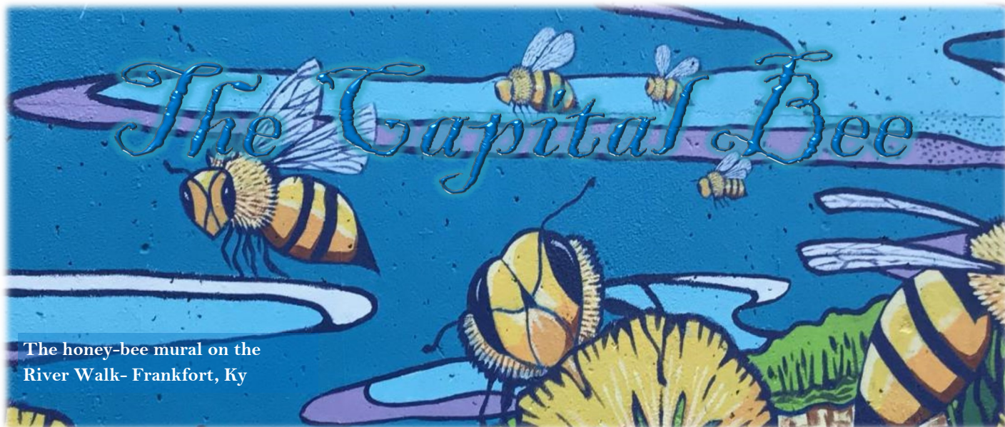
The honey-bee mural on the River Walk- Frankfort, Ky