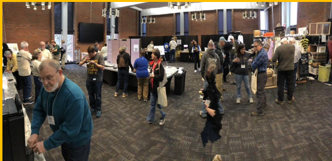
Louisville beekeeping & Research Conf. Vendor Area