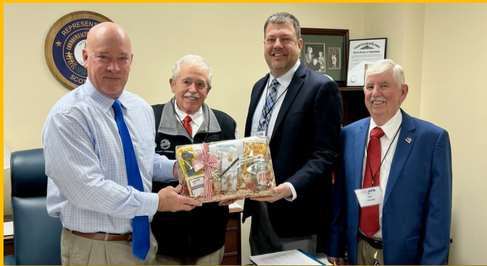
A basket with a Hive Products Kit presented to a legislator.

In the past month we also delivered 200 Deluxe Hive Products Kits to the Kentucky Farm Bureau for their Food Check-Out Day Program. Kentucky Farm Bureau and Kentucky commodity organizations observed Food Check-Out Day in Frankfort by distributing baskets of Kentucky-produced food items to members of the General Assembly. Baskets were delivered on February 7th, offering a positive way to remind our legislators, not only of the importance of agriculture to Kentucky's economy, but also to talk about critical issues facing agriculture and Kentucky farm families.