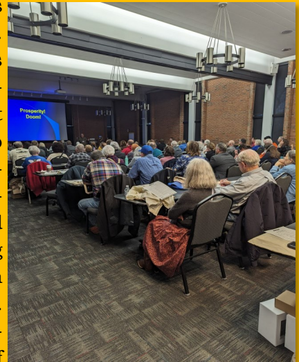
A full class at the LBR Conference

150 beekeepers in attendance. The attendees had several different breakout sessions to choose from covering Intermediate to Advanced learners along with a Research level of learning. There was an excellent group of speakers for the beekeepers to learn from and