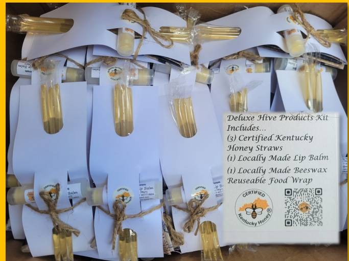
Deluxe Hive Products Kits for the Kentucky Farm Bureau Food Check-Out Day. (Contents inset)

Louisville Beekeeping and Research Conference. It was well attended for a first-year event with over