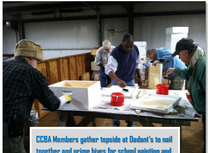
CCBA Members gather topside at Dadant's to nail together and prime hives for school painting and auction.

Painting and Auction. The hives complete with top covers and bottom boards, are painted by local schools and