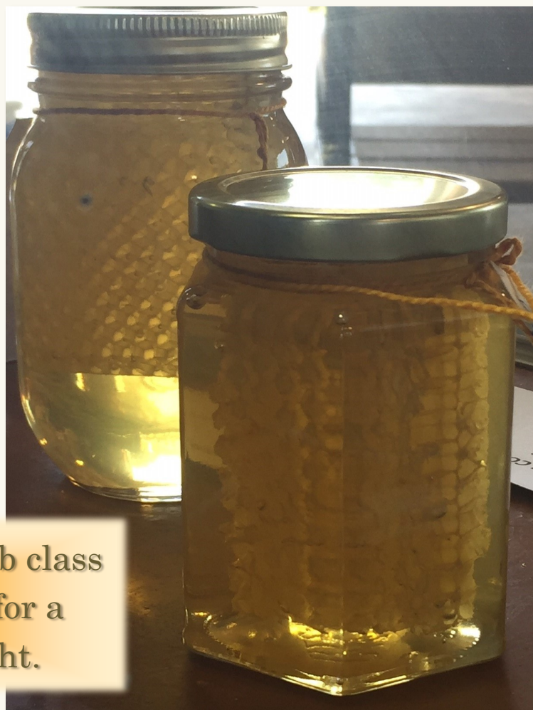
The Chunk Comb class entries make for a beautiful sight.