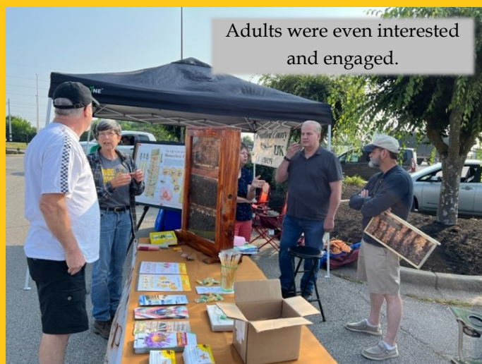
Adults were even interested and engaged.