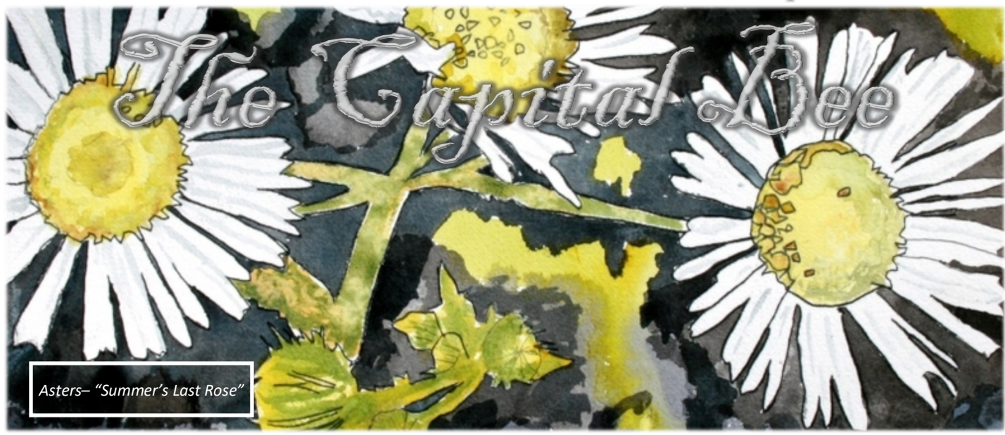
The Official Newsletter for The Capital City Beekeepers Association